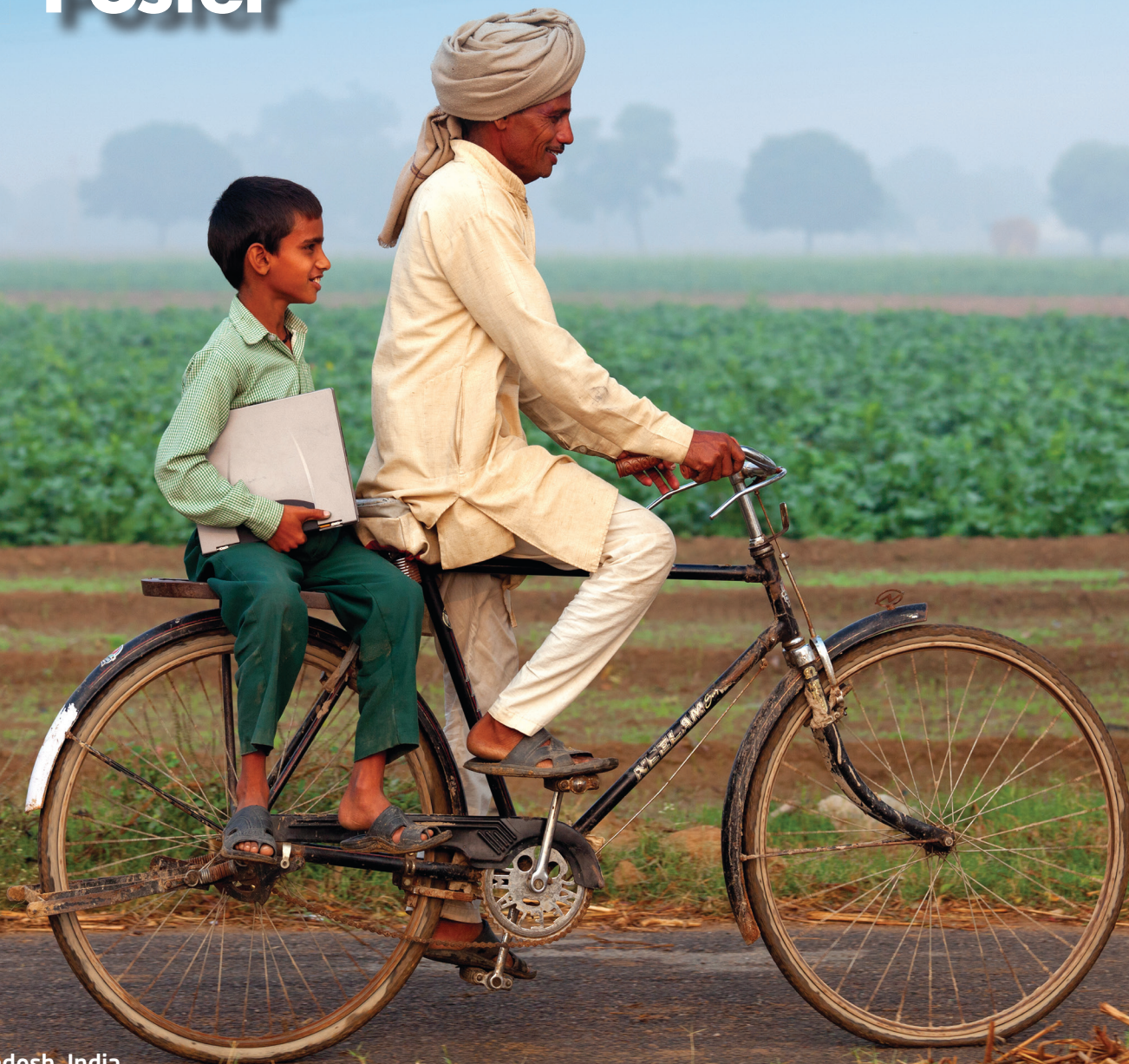
Father and son biking to school, Uttar Pradesh, India